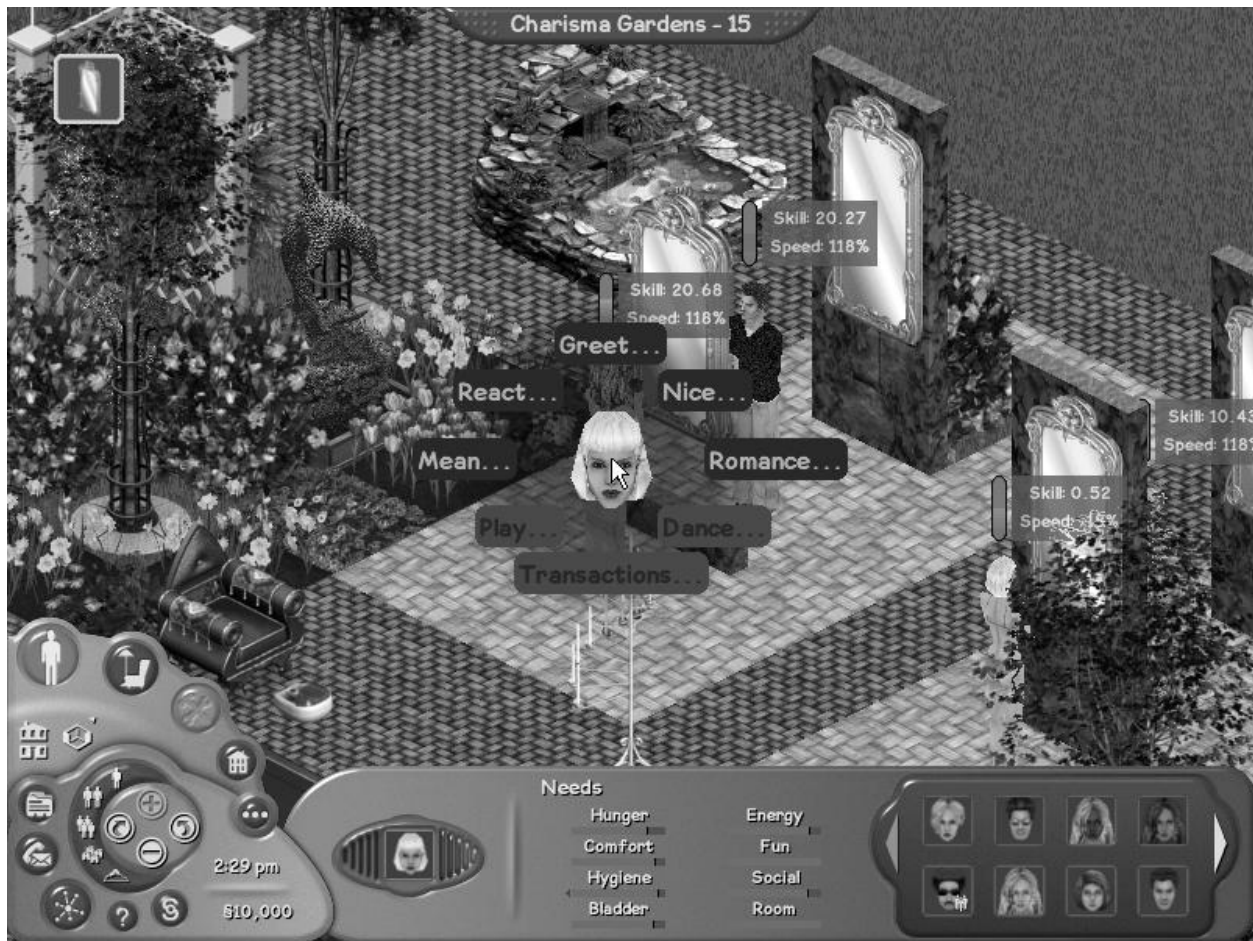
Fig. 3. Avatars practicing “charisma” before mirrors in a lavish interior. Clicking on another avatar gives you a “cloud” of interactive options; the sequence of tasks to be carried out by your avatar accumulates in the upper left corner. A needs panel monitors your avatar's state along eight dimensions.

Taking The Sims online involved two major design challenges, one social and one psychological. The psychological challenge was the shift from a godlike player to an embedded avatar. In KM's experience, we see some of the player-avatar dissociations that make this transition unsatisfactory. On the social front, the challenge was to establish some kind of resource scarcity. Kollock's seminal “Design principles for online communities” argues that scarcity is an important dimension of a vibrant online community, not just to keep things lively, but because “moderate amounts of risk are required for the development of trust ... and encourage the formation of groups and clubs as a way of managing that risk (or exploiting it, in the case of a