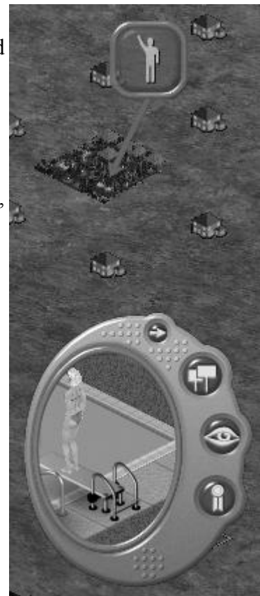
Fig. 2. Players can leave their avatars behind and like

In KM's diaries, we begin to understand why so little conversation takes place in The Sims Online : typical gameplay is characterized by long absences from the keyboard, as the robotic work of skilling is itself experienced as boring. Our analysis of her