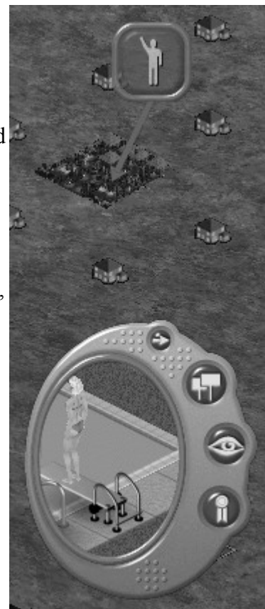
Fig. 2. Players can leave their avatars behind and like disembodied spirits view the world from above. In the meantime, the avatar continues to engage in activities as instructed.

In KM's diaries, we begin to understand why so little conversation takes place in The Sims Online : typical gameplay is characterized by long absences from the keyboard, as the robotic work of skilling is itself experienced as boring. Our analysis of her