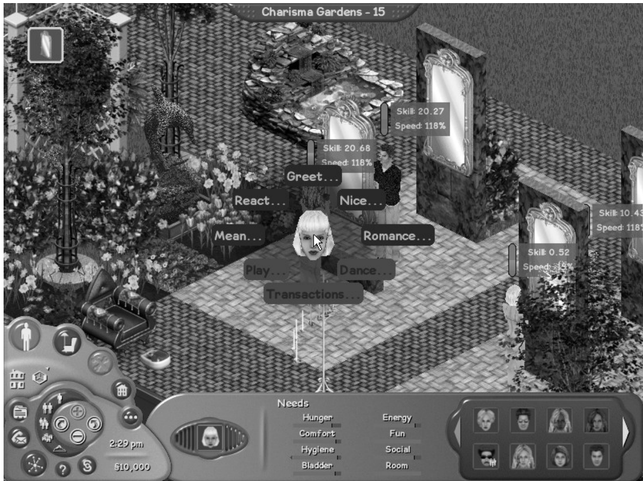
Fig. 3. Avatars practicing “charisma” before mirrors in a lavish interior. Clicking on another avatar gives you a “cloud” of interactive options; the sequence of tasks to be carried out by your avatar accumulates in the upper left corner. A needs panel monitors your avatar’s state along eight dimensions.